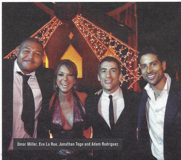
Omar Miller, Eva La Rue, Jonathan Togo and Adam Rodriguez